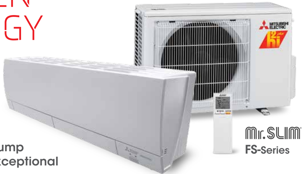
Mr. SLIM ® FS-Series

The most advanced Heat Pump technology for delivering exceptional heating performance.